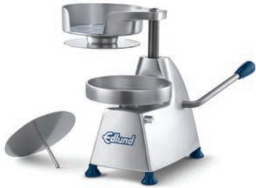
Removable press insert for easy cleaning