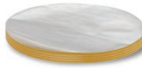
7 inch cellophane separator sheets available as an accessory