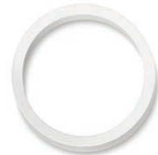
Optional 4.5 inch insert for EBP-500 (makes conversion easy)