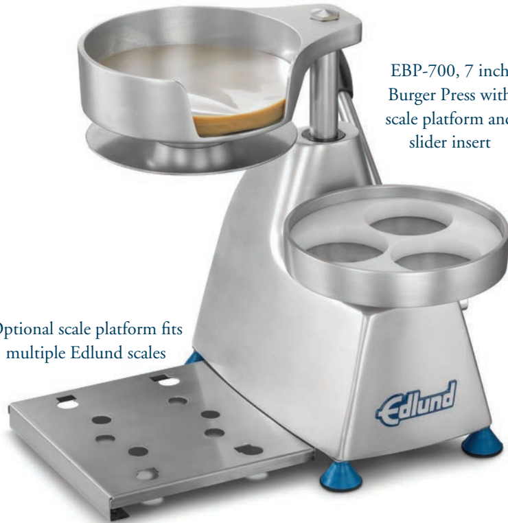
EBP-700, 7 inch Burger Press with scale platform and slider insert