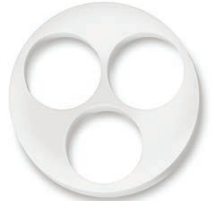
2.5 oz. slider insert