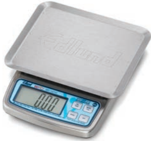
Recommended BRV-160W digital portion control scale