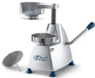
Removable press insert for easy cleaning