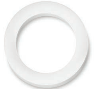
5 inch burger insert