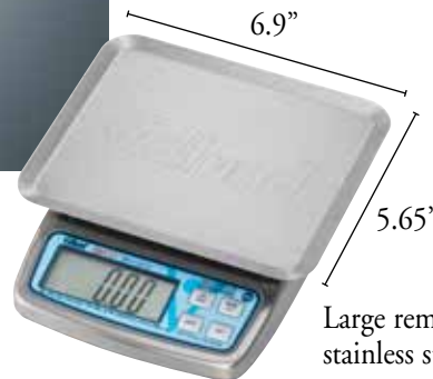
Large removable stainless steel oversized platform