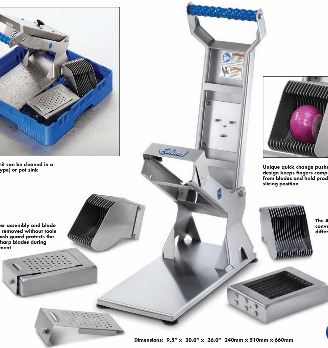
The ARC! can quickly convert to three different sizes

Dimensions: 9.5" x 20.0" x 26.0" 240mm x 510mm x 660mm