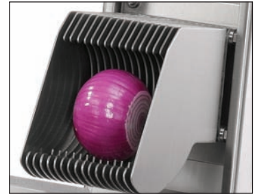
Unique quick change pusher/hopper design keeps fingers completely away from blades and hold product in perfect slicing position