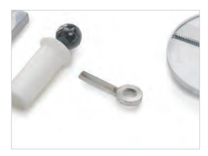
Included paddle to clear food from blade chamber and prevent product build-up