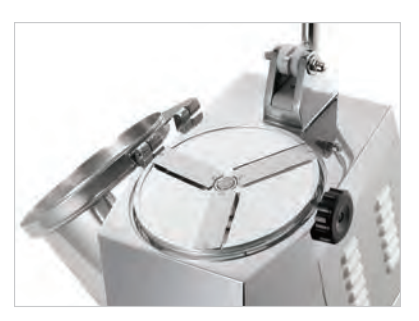
Auto shut-off switch when unit opens