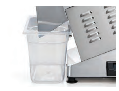
High speed motor and direct eject minimizes product damage and increases yields