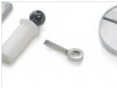
Included paddle to clear food from blade chamber and prevent product build-up