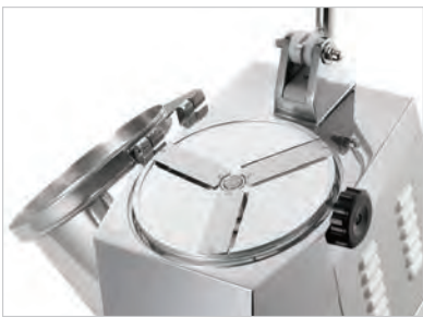
Auto shut-off switch when unit opens