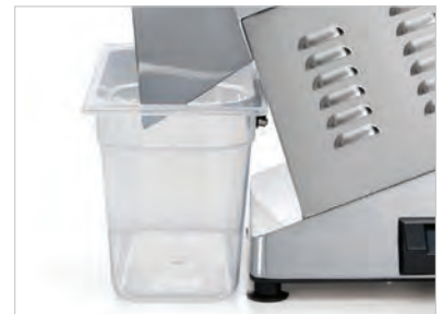
High speed motor and direct eject minimizes product damage and increases yields