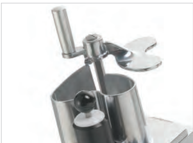
Integral safety inter-locks ensure safe product loading