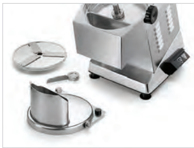
Removable components for easy cleaning