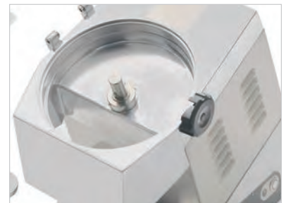
Full 3/4 horsepower motor for maximum performance