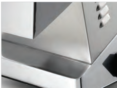
Solid stainless steel and aluminum construction