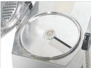
Auto blade brake ensures safe and efficient operation