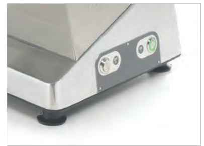
Sealed switches to prevent moisture damage