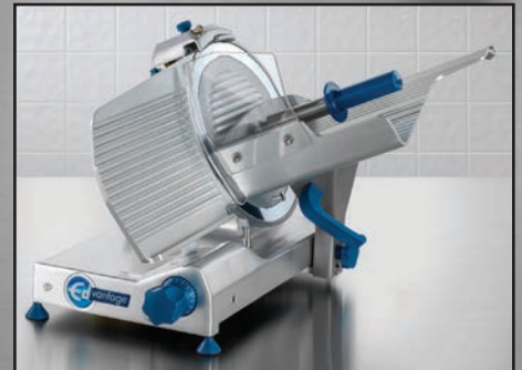
EDV-12 12" Medium Duty