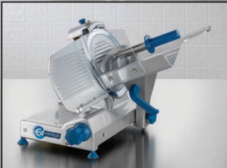
EDV-10C 10" Compact