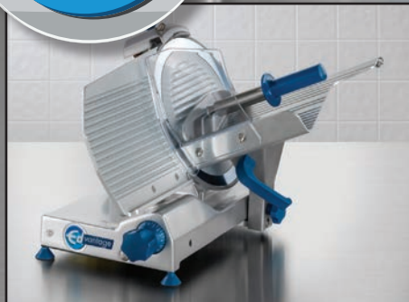
EDV-12C 12" Compact