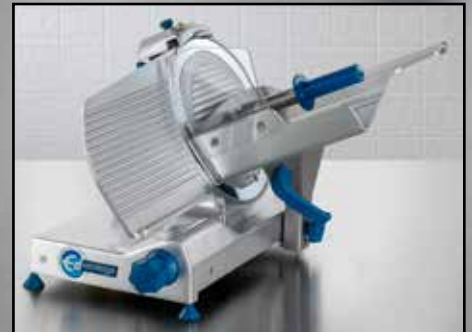
EDV-12 12" Medium Duty