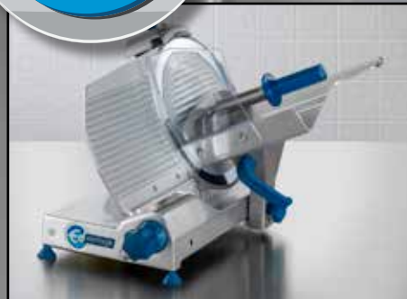
EDV-12C 12" Compact