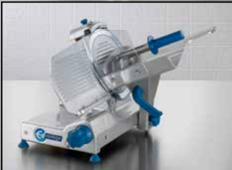
EDV-10C 10" Compact