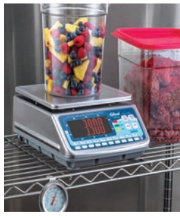
Perfect for weighing items in the walk-in (operating temperature 32-104°F)