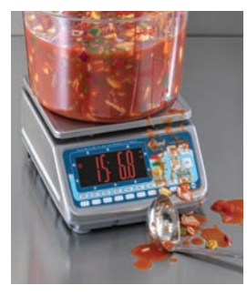
Waterproof and submersible for easy clean up