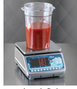
Accurately weighs fluid oz. and milliliters