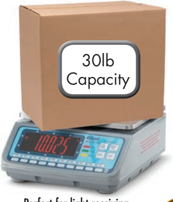
Perfect for light receiving up to 30lbs.