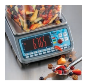
ClearShield™Protective Cover allows for easy clean up