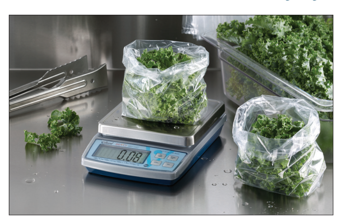
Model BRV-160 Display options include: 10lb x 0.1oz/160oz x 0.1oz/160oz x 1/8oz/5000g x 1g