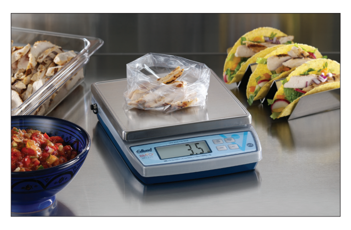
Model BRV-320 Display options include: 20lb x 0.1oz/320oz x 0.1oz/320oz x 1/8oz/10000g x 2g