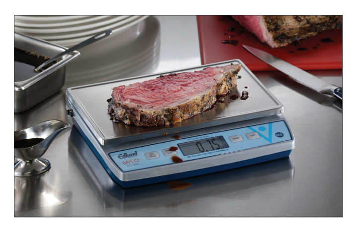
Model BRV-480 Display options include: 30lb x 0.2oz/480oz x 0.2oz/480oz x 1/4oz/15000g x 5g