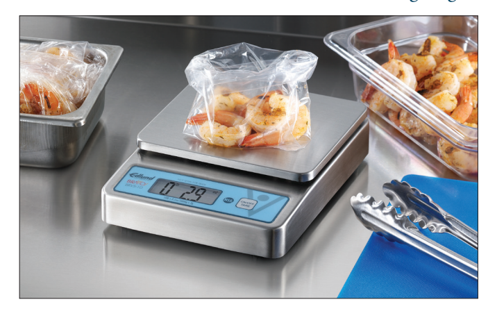
Model BRVS-10 Display options include: 10lb x 0.1oz /5000g x 2g