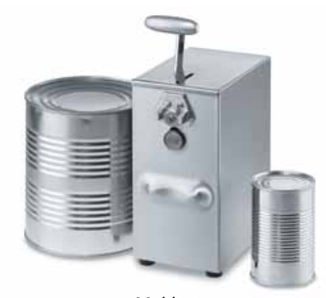
Model 203 2 speed can opener