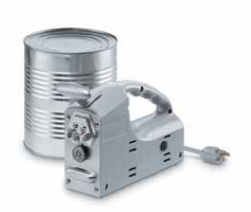
Model 201 "Take the can opener to the cans"