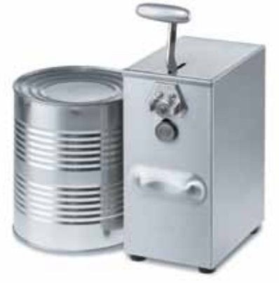
Model 266 Single speed can opener