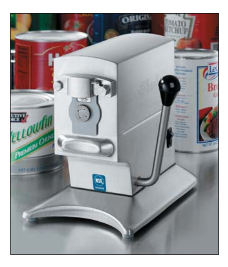
Opens most sizes and shapes of cans. Precisely weighted and balanced, the 270 lifts even the heaviest #10 can to the knife for easy opening.