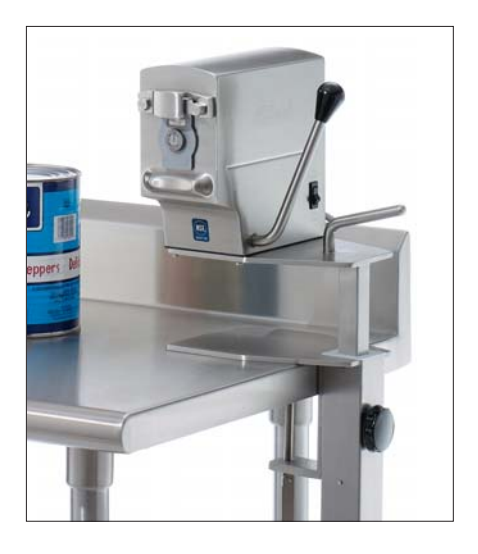
The 270 C's easy-glide slide bar mounting allows all cans larger than #10's to be opened easily. Ideal for most international can sizes.