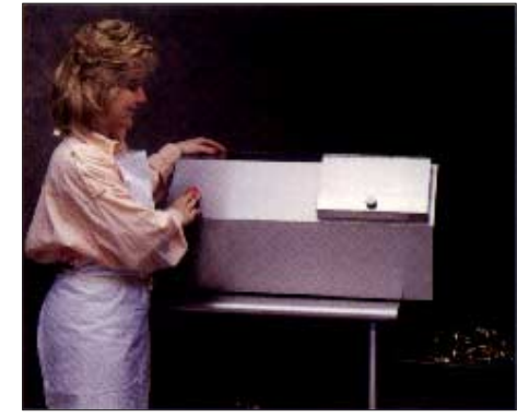
Close safety lid. Press button.