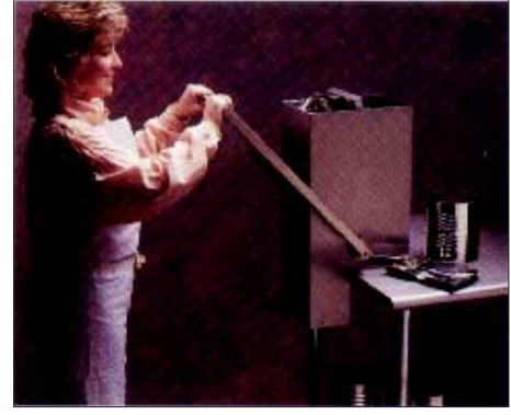
Pull the bandle forward and down. (repeat for larger cans)

CH-5000 30" L x 16" H x 12" W 76.2 cm x 40.6 cm x 30.5 cm CA-3000 26" L x 7½" H x 9" W 66.1 cm x 19.1 cm x 22.9 cm