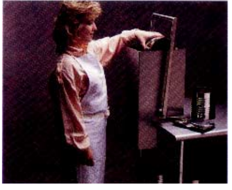
Place empty can in chamber.