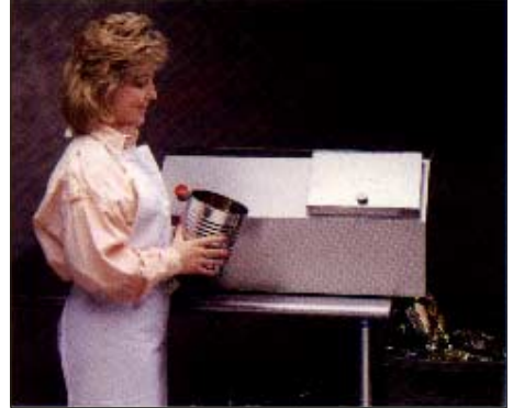
Crushed can falls into receptacle.