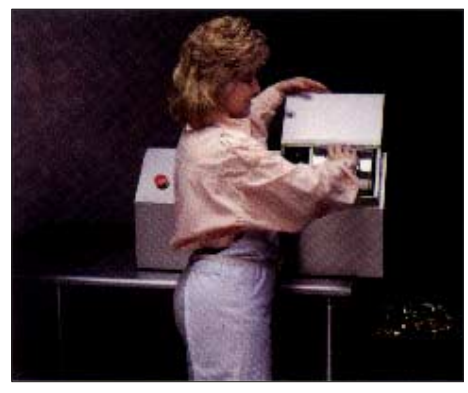
Place empty can in chamber.