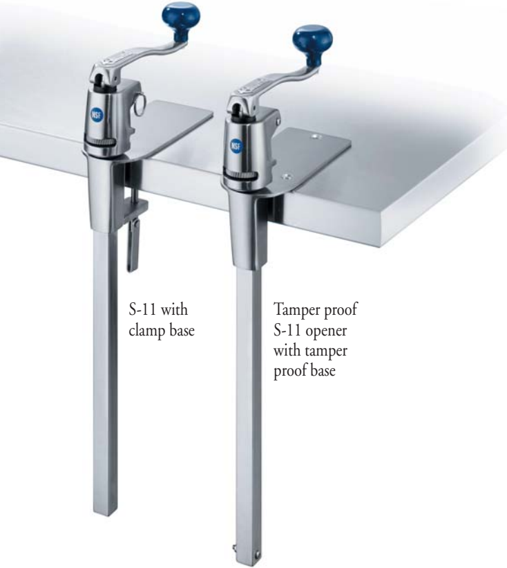
S-11 with clamp base