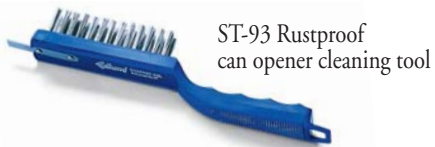
ST-93 Rustproof can opener cleaning tool