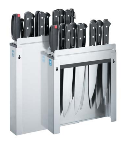
Back view of the KR-699 and KR-700 shows differentiation of the KR-700's stainless steel back for increased sanitation.