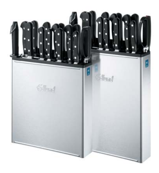
Front view of the KR-699 and KR-700 (14"/35.6 cm longer skirt) with a stainless steel skirt that protects knives and operators from accidents.