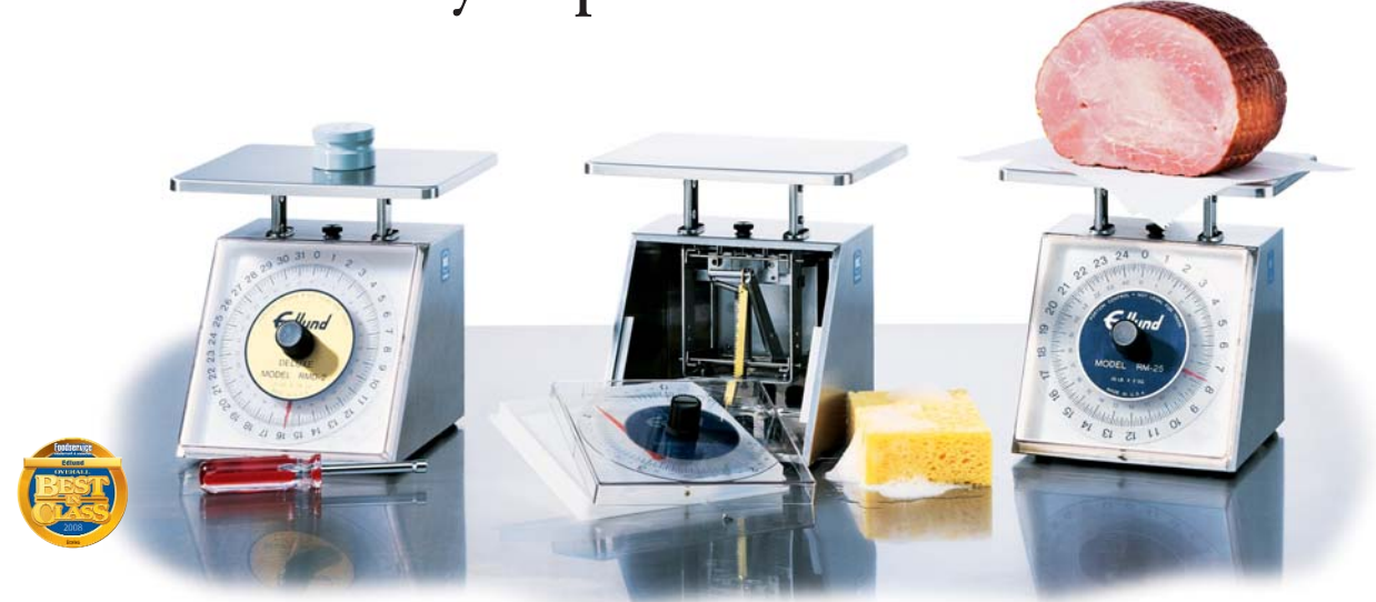
Shown with CK-32 calibration kit.

Edlund's Four Star Series brings a cleaner slant to your portion control needs.