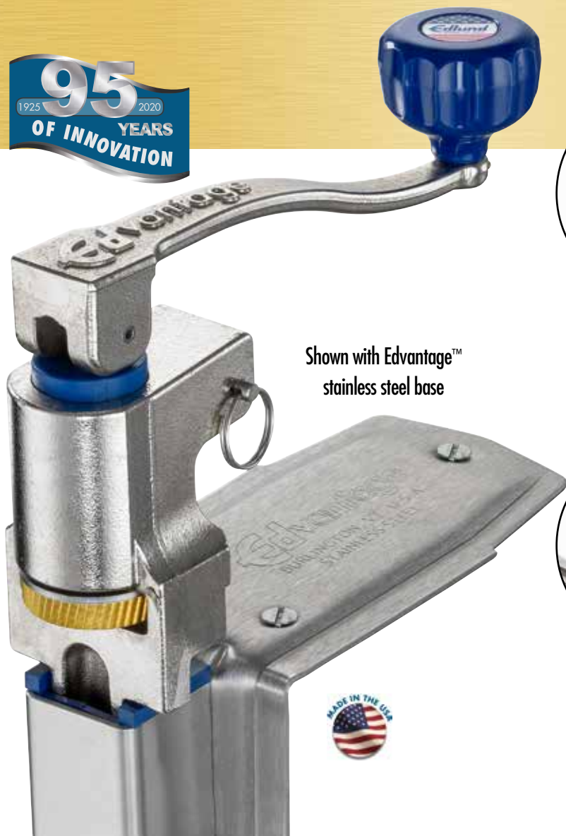
Shown with Edvantage™ stainless steel base