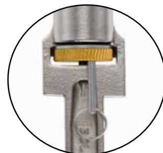
New! Tool-free disassembly for easy cleaning and part replacement