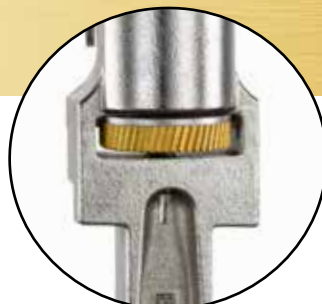
New! Edvancoat™ technology doubles wear life of gear