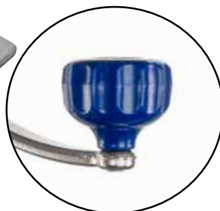
New! Larger ergonomic knob provides more comfort and reduces operator fatigue